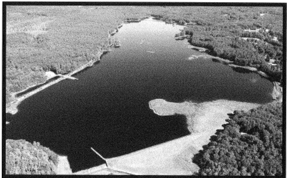
Quinapoxet Reservoir as seen from above.

If you are a property owner who rents or leases your property, please forward a copy of this impor- tant report to your tenants, or inform them that copies are available at the business office.